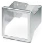
DIN rail adapter for EEM-MA600 and EEM-MA400 energy meters

DIN rail adapter - EEM-MKT-DRA - 2902078