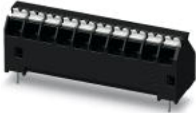
The figure shows the 10-position version

PCB terminal block, nominal current: 13.5 A, pitch: 3.81 mm, number of positions: 11, connection method: Push-in spring connection, mounting: THR soldering, conductor/PCB connection direction: 45 °, color: black