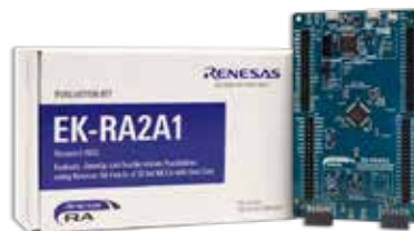
Evaluation Kit: EK-RA2A1