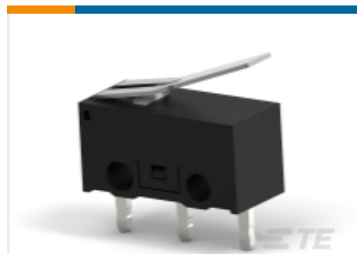
TE Model / Part # 2351447-1 UMINSA SW BLEV 0.74N 0.1A/30VDC SC PCB