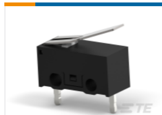
TE Model / Part # 2351447-2 UMINSA SW BLEV 0.74N 0.1A/30VDC NC PCB