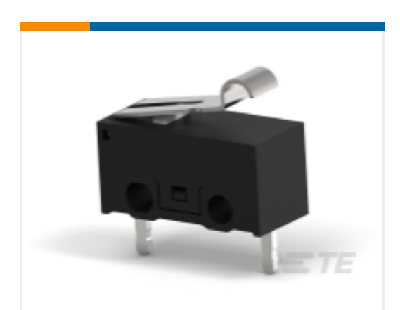
TE Model / Part # 2351449-