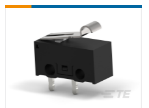
TE Model / Part # 2351449-