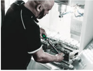
Click-Torque Wrench series