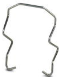
Relay retaining bracket, wire model, suitable for RIF-1 relay base, for 16 mm high octal miniature power and solid-state relays

Please be informed that the data shown in this PDF Document is generated from our Online Catalog. Please find the complete data in the user's documentation. Our General Terms of Use for Downloads are valid ( http://phoenixcontact.com/download )