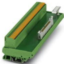
VARIOFACE termination board with knife disconnection and 50-pos. flat cable connector, module width: 214 mm

Please be informed that the data shown in this PDF Document is generated from our Online Catalog. Please find the complete data in the user's documentation. Our General Terms of Use for Downloads are valid ( http://phoenixcontact.com/download )