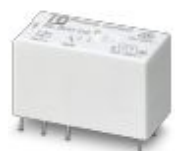
Plug-in miniature power relay, with power contact for high continuous currents, 1 PDT, input voltage 24 V DC

Single relay - REL-MR- 24DC/21HC - 2961312