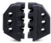
Spare die for CRIMPFOX-SC 6

Replacement die - CRIMPFOX-SC 6/DIE - 1212051