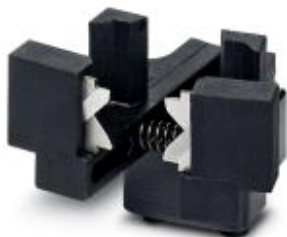
Replacement knife for the automatic stripping and crimping device CF 3000-2,5

Please be informed that the data shown in this PDF Document is generated from our Online Catalog. Please find the complete data in the user's documentation. Our General Terms of Use for Downloads are valid ( http://phoenixcontact.com/download )