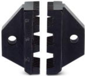
Spare die for CRIMPFOX 25R

Please be informed that the data shown in this PDF Document is generated from our Online Catalog. Please find the complete data in the user's documentation. Our General Terms of Use for Downloads are valid ( http://phoenixcontact.com/download )