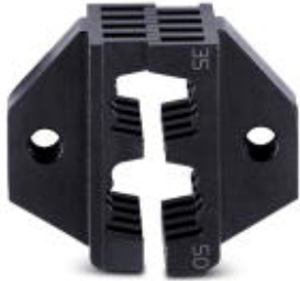
Spare die, for CRIMPFOX 50R

Please be informed that the data shown in this PDF Document is generated from our Online Catalog. Please find the complete data in the user's documentation. Our General Terms of Use for Downloads are valid ( http://phoenixcontact.com/download )