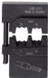
Die, for Crimpfox-M, for ferrules 16 - 25 mm 2 , packed in a serial storage box

Please be informed that the data shown in this PDF Document is generated from our Online Catalog. Please find the complete data in the user's documentation. Our General Terms of Use for Downloads are valid ( http://phoenixcontact.com/download )