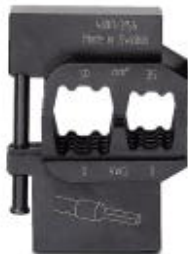
Die, for Crimpfox-M, for ferrules 35 - 50 mm 2 , packed in a serial storage box

Please be informed that the data shown in this PDF Document is generated from our Online Catalog. Please find the complete data in the user's documentation. Our General Terms of Use for Downloads are valid ( http://phoenixcontact.com/download )