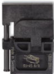
Die, for Crimpfox-M, for unshielded RJ45 connectors, packed in a serial storage box

Please be informed that the data shown in this PDF Document is generated from our Online Catalog. Please find the complete data in the user's documentation. Our General Terms of Use for Downloads are valid ( http://phoenixcontact.com/download )