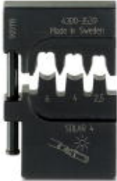
Die, for MC4 solar connectors, lateral entry, 2.5 - 6 mm 2

Please be informed that the data shown in this PDF Document is generated from our Online Catalog. Please find the complete data in the user's documentation. Our General Terms of Use for Downloads are valid ( http://phoenixcontact.com/download )