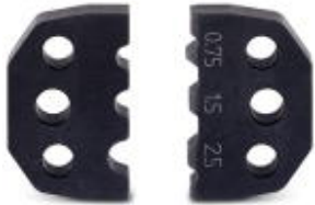
Spare die for CRIMPFOX-RC 2,5

Please be informed that the data shown in this PDF Document is generated from our Online Catalog. Please find the complete data in the user's documentation. Our General Terms of Use for Downloads are valid ( http://phoenixcontact.com/download )