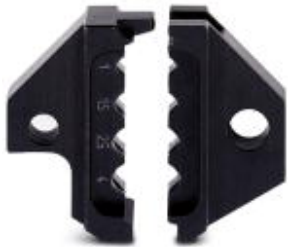
Spare die for CRIMPFOX-TC 4

Please be informed that the data shown in this PDF Document is generated from our Online Catalog. Please find the complete data in the user's documentation. Our General Terms of Use for Downloads are valid ( http://phoenixcontact.com/download )