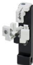
Replacement processing insert 0.5 mm 2 , for the crimping device CF 3000-2,5

Please be informed that the data shown in this PDF Document is generated from our Online Catalog. Please find the complete data in the user's documentation. Our General Terms of Use for Downloads are valid ( http://phoenixcontact.com/download )