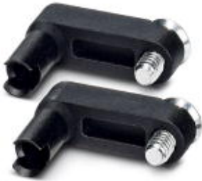
Replacement cable guide 1.5 mm 2 , for sleeve feed CF 3000 HZG 1,5

Please be informed that the data shown in this PDF Document is generated from our Online Catalog. Please find the complete data in the user's documentation. Our General Terms of Use for Downloads are valid ( http://phoenixcontact.com/download )