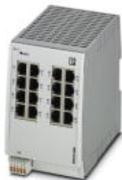
Managed Switch 2000, 16 RJ45 ports 10/100/1000 Mbps, degree of protection: IP20, PROFINET Conformance-Class A

Please be informed that the data shown in this PDF Document is generated from our Online Catalog. Please find the complete data in the user's documentation. Our General Terms of Use for Downloads are valid ( http://phoenixcontact.com/download )