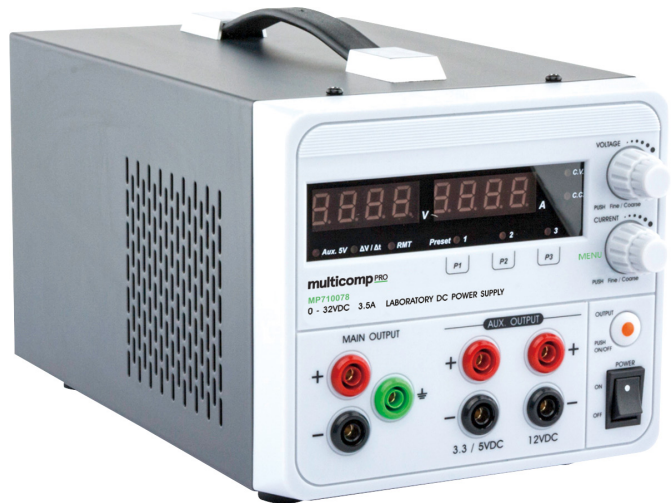
MP710078 & MP710078 US