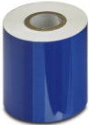
Ink ribbon, for roll printer for printing product group WMS... (black), width: 64 mm, color: white

Please be informed that the data shown in this PDF Document is generated from our Online Catalog. Please find the complete data in the user's documentation. Our General Terms of Use for Downloads are valid ( http://phoenixcontact.com/download )