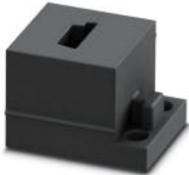
Small, slotted cable sleeves suitable for one AS-i cable (R), material: NBR, version: right

Please be informed that the data shown in this PDF Document is generated from our Online Catalog. Please find the complete data in the user's documentation. Our General Terms of Use for Downloads are valid ( http://phoenixcontact.com/download )