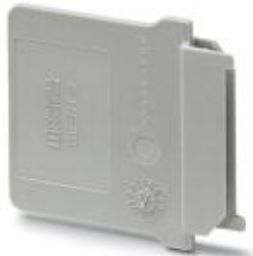
Path extension, color: gray

Please be informed that the data shown in this PDF Document is generated from our Online Catalog. Please find the complete data in the user's documentation. Our General Terms of Use for Downloads are valid ( http://phoenixcontact.com/download )