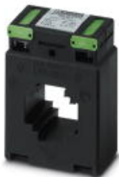
Window-type current transformer, 300 A AC primary current; 5 A AC secondary current; accuracy class 1; 7.5 VA rated power

Please be informed that the data shown in this PDF Document is generated from our Online Catalog. Please find the complete data in the user's documentation. Our General Terms of Use for Downloads are valid ( http://phoenixcontact.com/download )