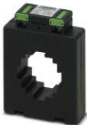
Window-type current transformer, 400 A AC primary current; 5 A AC secondary current; accuracy class 1; 10 VA rated power

Please be informed that the data shown in this PDF Document is generated from our Online Catalog. Please find the complete data in the user's documentation. Our General Terms of Use for Downloads are valid ( http://phoenixcontact.com/download )