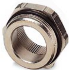
Cable glands for Pg21 half screw connection to Pg21 housing entry, metal

Please be informed that the data shown in this PDF Document is generated from our Online Catalog. Please find the complete data in the user's documentation. Our General Terms of Use for Downloads are valid ( http://phoenixcontact.com/download )