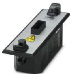
CHECKMASTER 2 test adapter for the PLT-SEC...UT/PT product ranges, 17.5 mm

Please be informed that the data shown in this PDF Document is generated from our Online Catalog. Please find the complete data in the user's documentation. Our General Terms of Use for Downloads are valid ( http://phoenixcontact.com/download )