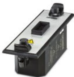
CHECKMASTER 2 test adapter for the UFBK and UAK PLUGTRAB product ranges.

Please be informed that the data shown in this PDF Document is generated from our Online Catalog. Please find the complete data in the user's documentation. Our General Terms of Use for Downloads are valid ( http://phoenixcontact.com/download )