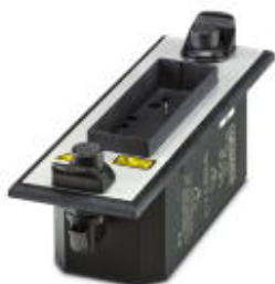
CHECKMASTER 2 test adapter for the FLT-SEC-H product range.

Please be informed that the data shown in this PDF Document is generated from our Online Catalog. Please find the complete data in the user's documentation. Our General Terms of Use for Downloads are valid ( http://phoenixcontact.com/download )