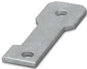
Plate for fixing the FLT-ISG-100-EX isolating spark gap to a flange, drill hole diameter of 11 mm.

Please be informed that the data shown in this PDF Document is generated from our Online Catalog. Please find the complete data in the user's documentation. Our General Terms of Use for Downloads are valid ( http://phoenixcontact.com/download )