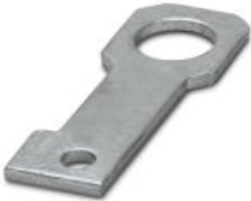
Plate for fixing the FLT-ISG-100-EX isolating spark gap to a flange, drill hole diameter of 26 mm.

Please be informed that the data shown in this PDF Document is generated from our Online Catalog. Please find the complete data in the user's documentation. Our General Terms of Use for Downloads are valid ( http://phoenixcontact.com/download )