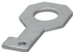
Plate for fixing the FLT-ISG-100-EX isolating spark gap to a flange, drill hole diameter of 36 mm.

Please be informed that the data shown in this PDF Document is generated from our Online Catalog. Please find the complete data in the user's documentation. Our General Terms of Use for Downloads are valid ( http://phoenixcontact.com/download )