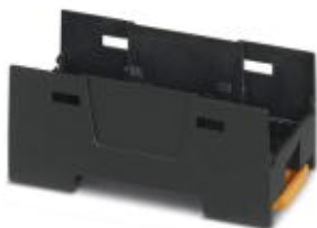
DIN rail housing, Lower housing part with base latch, flat design, width: 35.1 mm, height: 75 mm, Depth: 30.3 mm, color: black (9005)

Please be informed that the data shown in this PDF Document is generated from our Online Catalog. Please find the complete data in the user's documentation. Our General Terms of Use for Downloads are valid ( http://phoenixcontact.com/download )