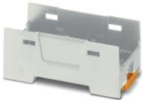
DIN rail housing, Lower housing part with base latch, flat design, width: 35.1 mm, height: 75 mm, Depth: 30.3 mm, color: light gray (7035)

Please be informed that the data shown in this PDF Document is generated from our Online Catalog. Please find the complete data in the user's documentation. Our General Terms of Use for Downloads are valid ( http://phoenixcontact.com/download )