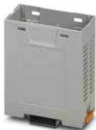
DIN rail housing, Lower housing part with base latch, tall design, with vents, width: 35.1 mm, height: 75 mm, Depth: 87.3 mm, color: light gray (7035)

Please be informed that the data shown in this PDF Document is generated from our Online Catalog. Please find the complete data in the user's documentation. Our General Terms of Use for Downloads are valid ( http://phoenixcontact.com/download )