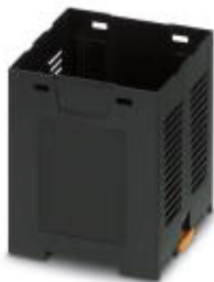
DIN rail housing, Lower housing part with base latch, tall design, with vents, width: 70.1 mm, height: 75 mm, Depth: 87.3 mm, color: black (9005)

Please be informed that the data shown in this PDF Document is generated from our Online Catalog. Please find the complete data in the user's documentation. Our General Terms of Use for Downloads are valid ( http://phoenixcontact.com/download )