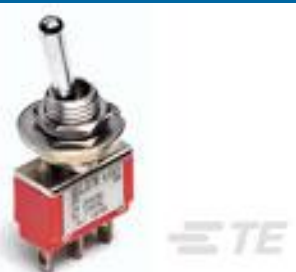
TE Model / Part # 4-1825136-9 A101SYZQ04