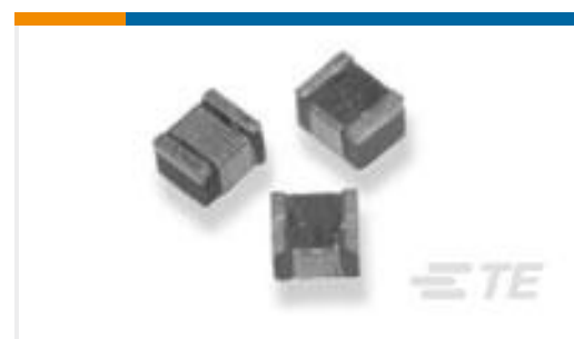
TE Model / Part #5- 1624113-3 3650 2A 0.24uH 5% 2K RL