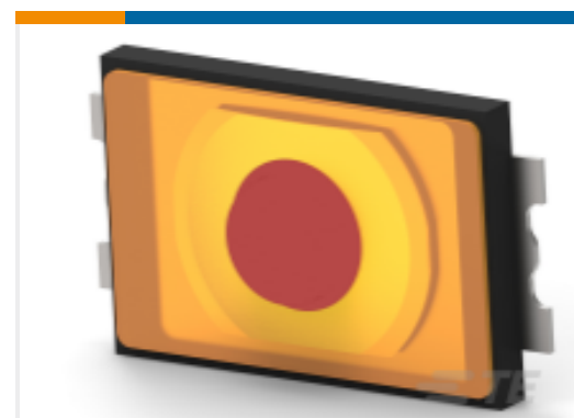
TE Model / Part #2337230-1 TACT ULTRA TB 3.0X2.0X0. 6 160GF