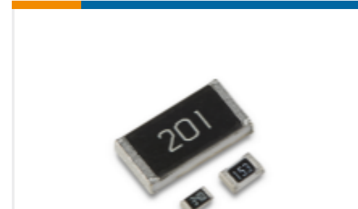
TE Model / Part #3- 2176325-1 CRGP 0402 3K3 1%