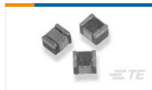
TE Model / Part #1879023-1 3650 1008 5.6nH 5% 2K RL