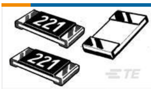
TE Model / Part #6- 2176230-3 3522 120K 5% 3W