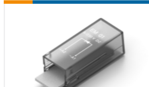
TE Model / Part #1415037-1 PTMT00LO