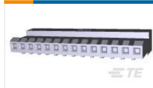
TE Model / Part #4-640429- 4 14P MTA156 CONN ASSY 24AWG WHT