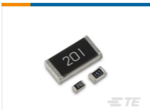
TE Model / Part #4- 2176325-7 CRGP 0402 68K 1%