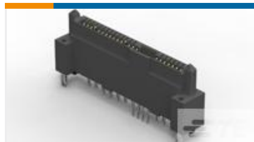
TE Model / Part #1735690-1 SAS RECEPT, VERTICAL, EXT HT, PRESS-FIT