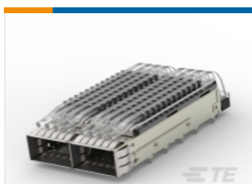
TE Model / Part #4-2170808-5 QSFP28, 1X2, CAGE ASSY, SPRING, HS, LP