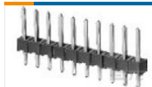
TE Model / Part #1-146282-0 10 MODII HDR SRST B/A . 100CL