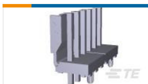
TE Model / Part #3-644615-6 06P MTA156 POL HDR ASSY LF