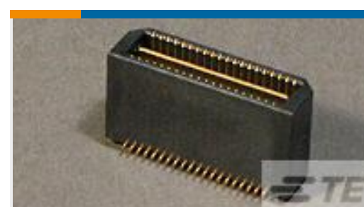
TE Model / Part #1658015-1 MSB0.80PL11ASY040FL,-, 10,-TY