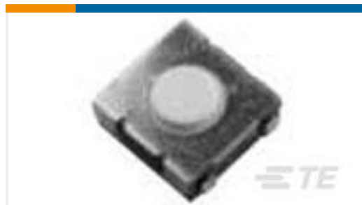
TE Model / Part #1571625-4 TACT,6X6,SMT,J-LEAD, 100GF,T&R