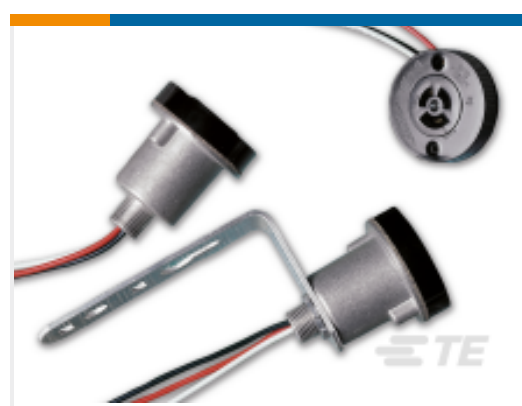
TE Model / Part #385640-000 ALR-AM-1-A-NB