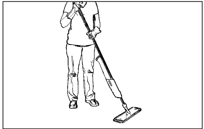
Figure 5. Applying floor finish with Flat Mop (optional).