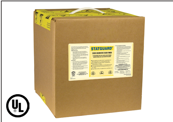
Figure 1. Statguard® Static Dissipative Floor Finish