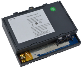
Battery Specification Table