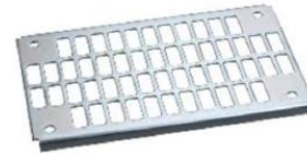
Telequick compact control desks NSYTMP*