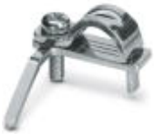
Shield connection clamp for printed circuit terminal block

Shield connection clamp - ME-SAS MINI - 2200456