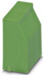
DIN rail housing, Filler plug for unoccupied terminal points, color: green (6021)

Please be informed that the data shown in this PDF Document is generated from our Online Catalog. Please find the complete data in the user's documentation. Our General Terms of Use for Downloads are valid ( http://phoenixcontact.com/download )