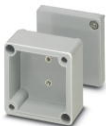
Junction box, material: Polyester fiberglass reinforced, squirrell grey RAL 7000, 75 mm x 80 mm x 56 mm, type of locking: Screw-on cover

Please be informed that the data shown in this PDF Document is generated from our Online Catalog. Please find the complete data in the user's documentation. Our General Terms of Use for Downloads are valid ( http://phoenixcontact.com/download )