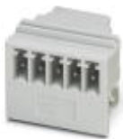
PCB headers, number of positions: 5, pitch: 3.5 mm, color: light gray, contact surface: Tin, pin layout: Linear pinning, solder pin [P]: 2 mm, Article with lateral pin exit

Feed-through header - MCO 1,5/ 5-G1L-3,5 KMGY - 2278380