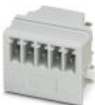
PCB headers, number of positions: 5, pitch: 3.5 mm, color: light gray, contact surface: Tin, pin layout: Linear pinning, solder pin [P]: 2 mm, Article with lateral pin exit

Feed-through header - MCO 1,5/ 5-G1R-3,5 KMGY - 2278351