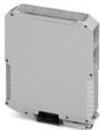
DIN rail housing, Complete housing with metal foot catch, tall design, without vents, width: 22.5 mm, height: 99 mm, depth: 114.5 mm, color: light gray (7035)

Please be informed that the data shown in this PDF Document is generated from our Online Catalog. Please find the complete data in the user's documentation. Our General Terms of Use for Downloads are valid ( http://phoenixcontact.com/download )