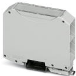
Complete housing, Ultra-flat design, without vents, width: 22.5 mm, depth: 85 mm

Please be informed that the data shown in this PDF Document is generated from our Online Catalog. Please find the complete data in the user's documentation. Our General Terms of Use for Downloads are valid ( http://phoenixcontact.com/download )